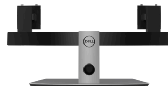
DELL DUAL MONITOR STAND | MDS19

Hear every word clearly on your next call with the Dell Pro Stereo Headset, optimized to provide in-person call quality.