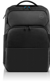
DELL PRO SLIM BACKPACK 15 | PO1520PS

Featuring the widest variety of ports available, the compact 7-in-1 Dell USB-C Mobile Adapter offers seamless connectivity to various devices like monitors, projectors, headsets, keyboard, mouse, flash drives and other accessories.