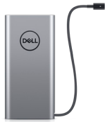
DELL USB-C NOTEBOOK POWER BANK 65W/65WHR | PW7018LC

Work seamlessly with dual-mode connectivity (2.4GHz wireless or Bluetooth) and 36 months of