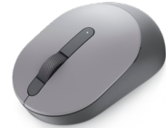
DELL MOBILE WIRELESS MOUSE | MS3320W

A dependable everyday companion providing eco-friendly quality protection and water-resistant protective coating for your device and other essentials.