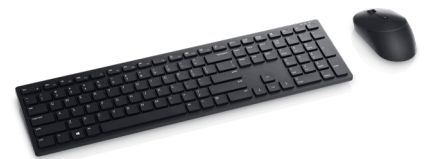
DELL PRO WIRELESS KEYBOARD AND MOUSE | KM5221W

A 23.8" monitor enhances your daily workflow. Featuring a height adjustable stand, Full HD resolution and integrated speakers in a space-saving design.