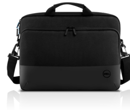
DELL PRO SLIM BRIEFCASE 15 | PO1520CS

With fast, high-power delivery of up to 65W/hr, this power bank can charge the widest range of USB-C® laptops and mobile devices.